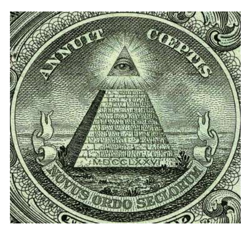
"Ye cannot serve God and mammon." - Luke 16:13

"For God so loved the world, that he gave his only begotten Son, that whosoever believeth in him should not perish, but have everlasting life." - John 3:16